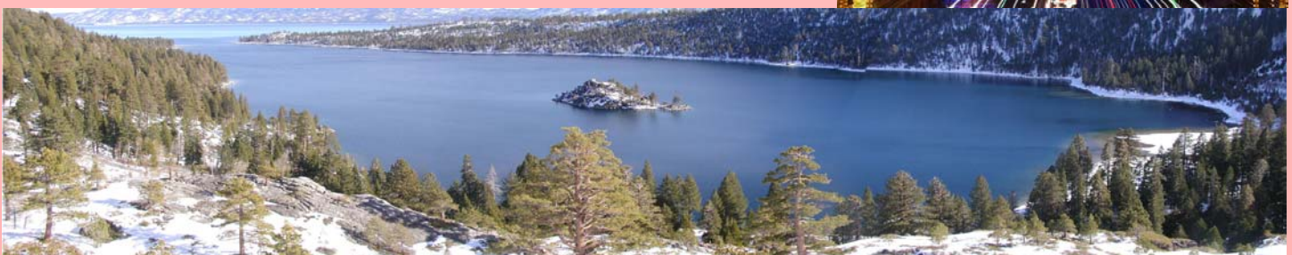
Lake Tahoe, NV